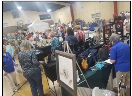
"Vendors and Shoppers"